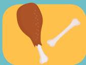
meat & bones