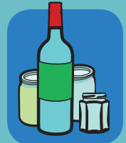
bottles & jars