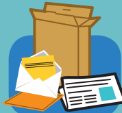
paper & cardboard