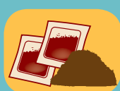
teabags & coffee