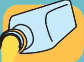
cooking oil & fats