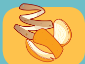
fruit & veg