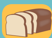
bread & pastries