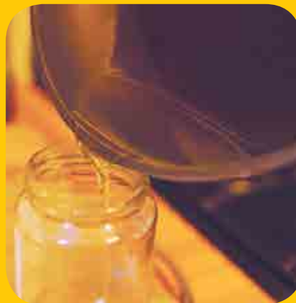
2. Pour the used cooking oil into a glass or plastic bottle with a lid.