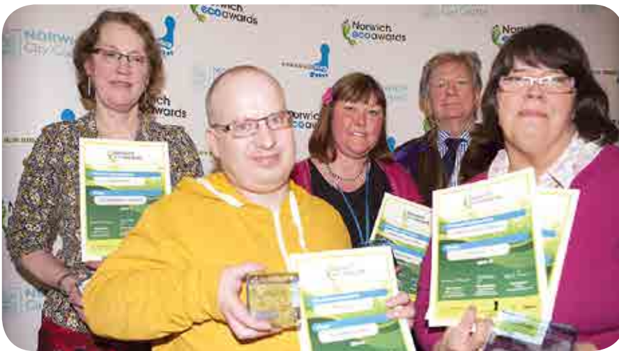
The winners of this year's Eco Awards.