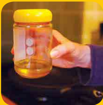
3. Take the oil to your nearest used cooking oil recycling bin.