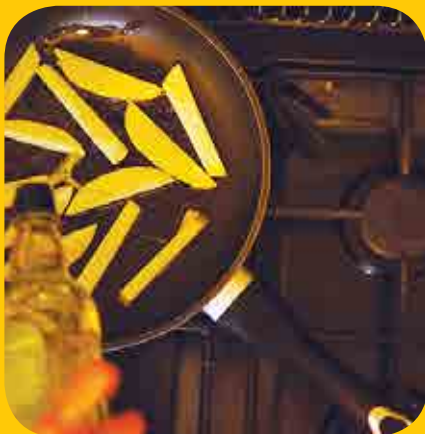
1. Let the used cooking oil or grease cool to a safe handling temperature.

Please check our website for the service start date: www.norwich.gov.uk/cookingoil .