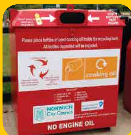
4. Place the container with the oil in it in the recycling bin.