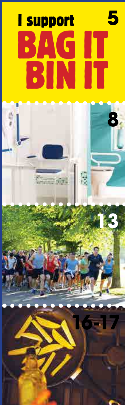
Front cover picture courtesy of Archant.

PAGES 16-17 Even more ways to recycle your waste