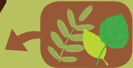
leaves and shrubs