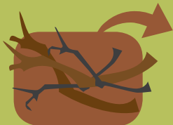
twigs and small branches